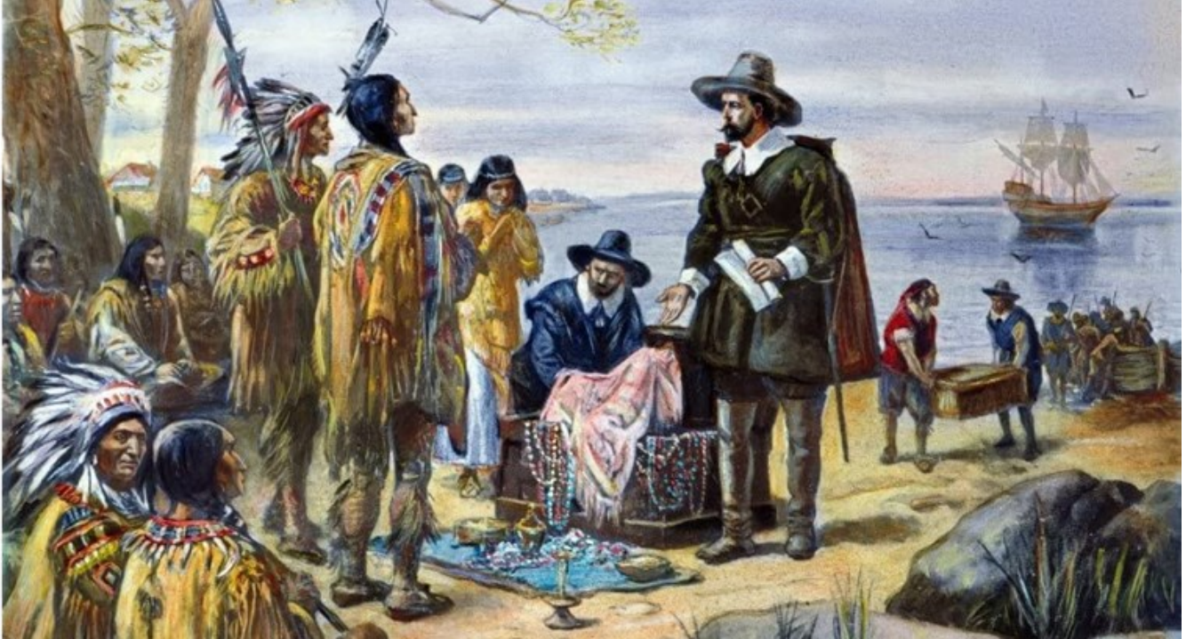
'The Purchase of Manhattan Island by Peter Minuit, 1626' by Alfred Fredericks.

In 1626, so the story goes, the native Lenape people sold the island of Manhattan, to the Dutch East India Company for 60 guilders worth of trinkets, the supposed equivalent of $24. A famously bad trade for the tribe given the island's current estimated value of well over a trillion dollars.