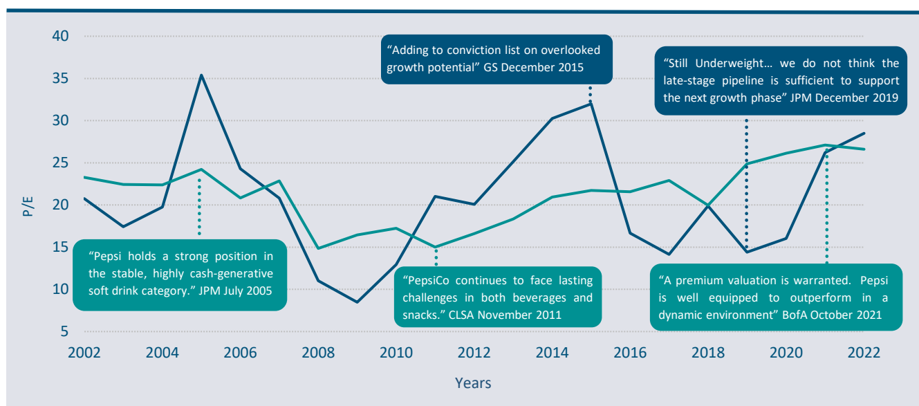
Figure 5: Annual P/E multiples for Astellas and PepsiCo, plotted over a 20-year period with selected snippets of broker commentary illustrating the contemporary and coincident cycles of both valuation and opinion.

But that may be harder than it sounds. If five years later, the shares are down, and the analyst commentary is negative, it will then be tempting to cut your losses and move back into something ‘better’ without the baggage of half-a-decade’s underperformance. These companies are easy to sell. Do this a few times and you’re locked into a cycle of repeating the mistake. None of this means it is never right to transact, but with a long-term approach, I suggest thinking hard before doing so. Impatient drivers who continually change lanes rarely make much progress.