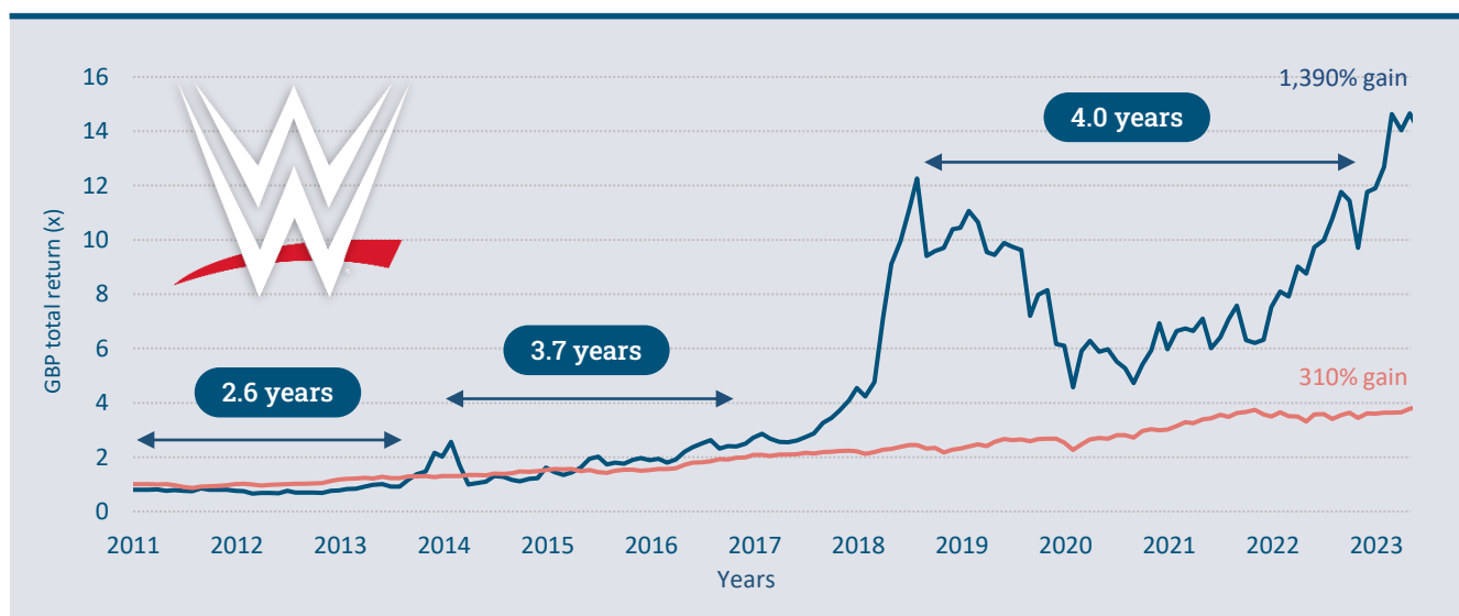
Figure 6: GBP total return chart for WWE as an independent entity over our holding period from March 2011 to its merger with UFC to create TKO in September 2023. Note three separate multi-year periods generating negative returns, but the strong overall outperformance vs. the MSCI World.

James Bullock, Portfolio Manager Lindsell Train Ltd