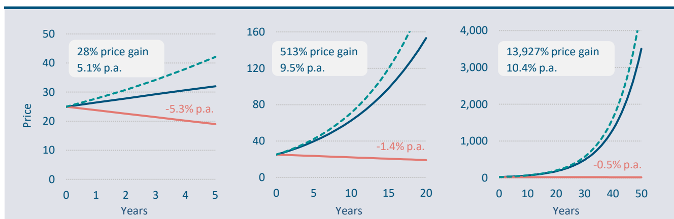
Figure 2: Linear derating vs. compound growth over three separate time horizons. As per the prior example, these charts illustrate three different holding periods over which the P/E multiple on an initial unit of earnings declines a fixed 24% from 25x to 19x (the pink line illustrates this absent earnings growth). This annualises to -5.3% over five years, -1.4% over 20 and -0.5% over 50 years, allowing an earnings/dividend stream compounding at 11% (the dotted green lines illustrate this absent the change in ratings) to deliver price returns (the blue lines) of 28%, 513% and 13,927% respectively.

● Compounding earnings at 11% p.a. ● P/E ratio falling from 25x to 19x ● Price