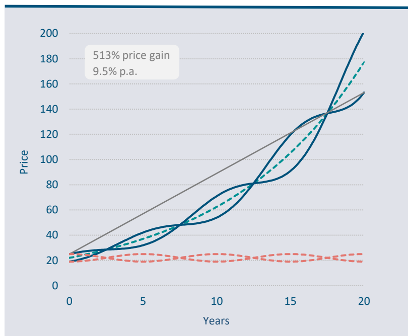
Figure 4: Cyclical derating vs. compound growth over a single 20-year time horizon. This is a similar chart to the second panel in Figure 2, with the difference that instead of the P/E declining linearly from 25x to 19x, it cycles sinusoidally between these peaks and troughs with a period of five years (the two pink lines representing two offset phases, as before absent any earnings growth). As in Figure 2, also shown is the uninterrupted compounding of earnings or dividends at 11% p.a. (represented by the green dashed line, absent any ratings change), whilst the two blue lines illustrate the respective impact of all of this on price. Buying at the peak 25x multiple and selling 20 years later at the 19x trough (the grey line connects this trade) again results in the same 9.5% p.a. price return (or a cumulative 513%), regardless of what has happened in between. However, switching repeatedly between investments every five years slashes this return to 5.1% p.a. (or a cumulative 169%); the same result as simply repeating the five-year investment from the first chart in Figure 3 over again.

● Compounding earnings at 11% p.a. ● P/E Ratio cycling between 25x to 19x ● Price